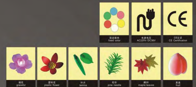
产品规格表 SPECIFICATIONS TABLE