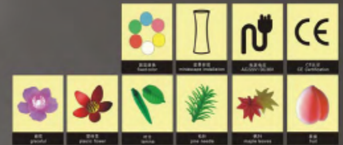
产品规格表 SPECIFICATIONS TABLE